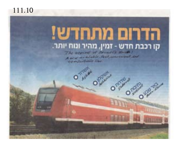
A super advert for the newly-opened line from Ashkelon through to Beer Sheba.