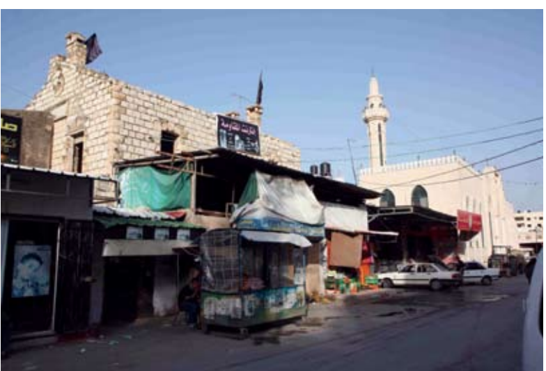
The former station at Jenin, February 2015.