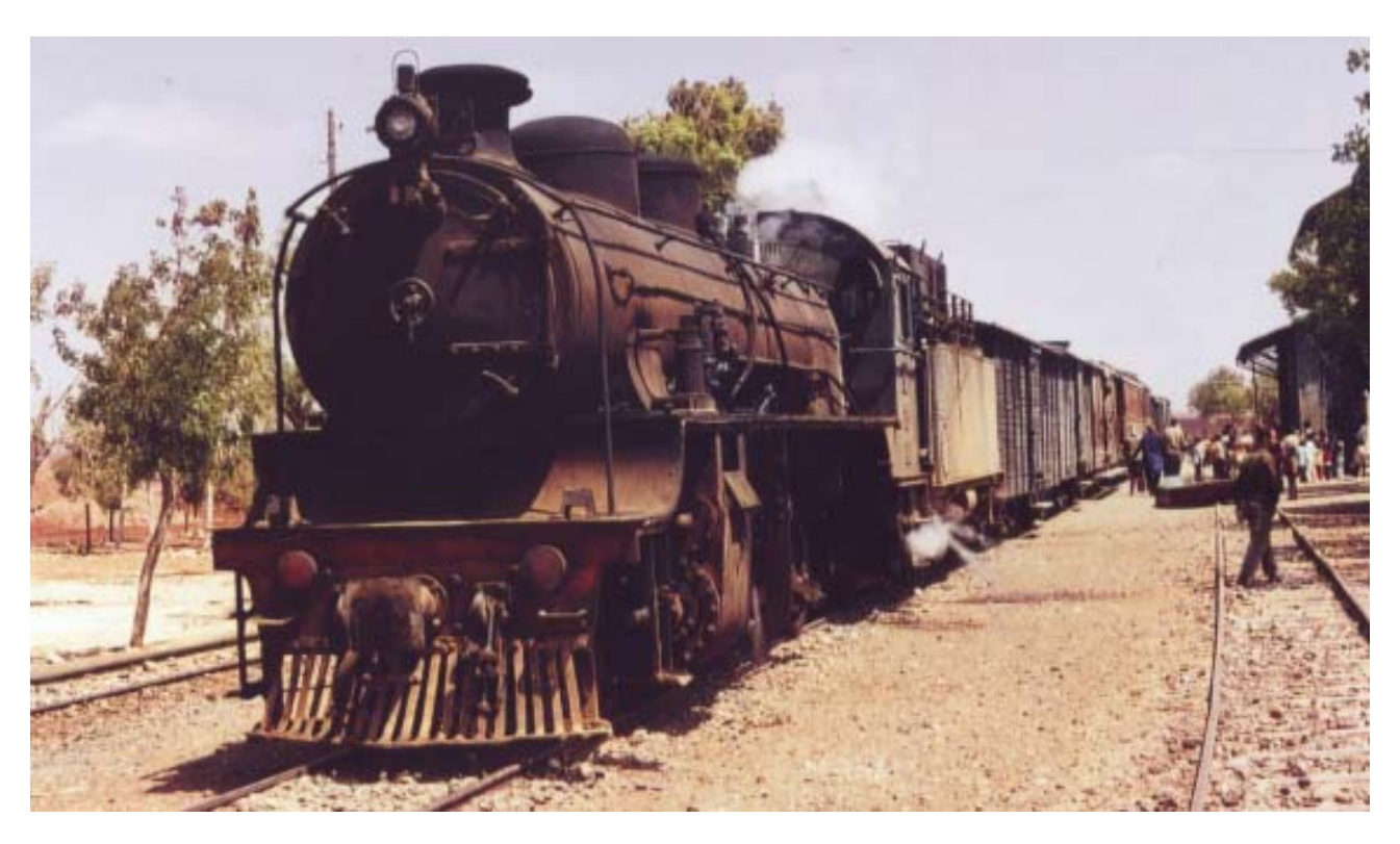
75:01. Bygone Days on the Hedjaz Railway. A mixed train in Syria in the 1980's. (Photo: Keith Chester).