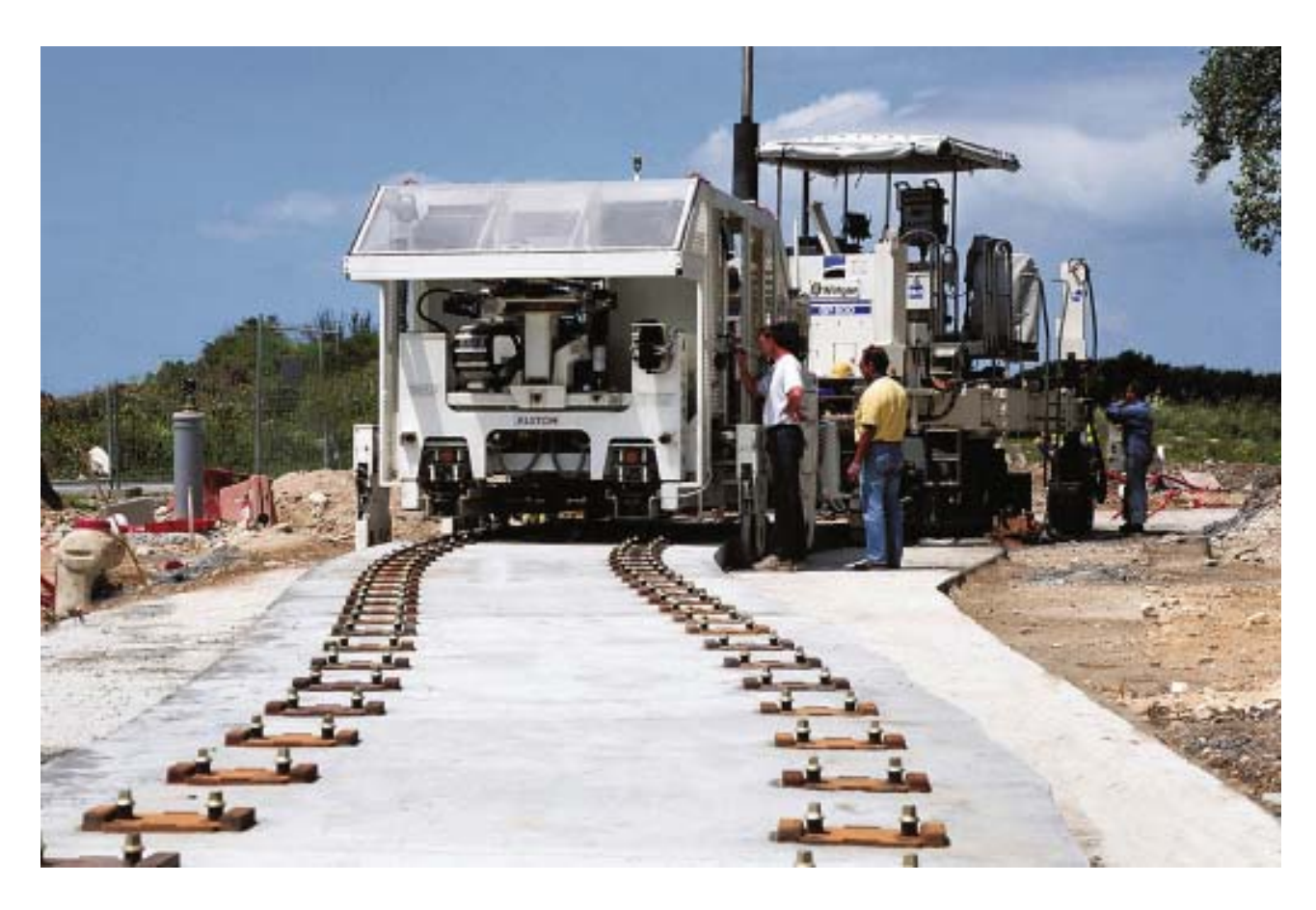
The actual first track laying (after the 22.11.06 official ceremony) at Mount Herzl, Jerusalem. 75:13 Cadem, preserved Coach.