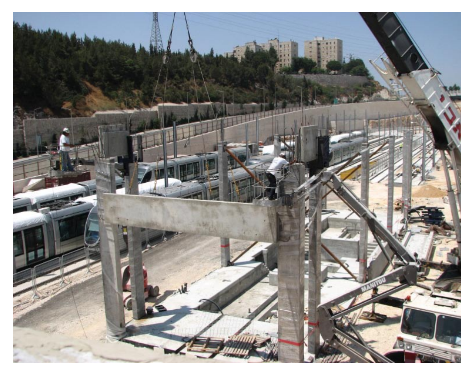
Tenders, continued from previous page